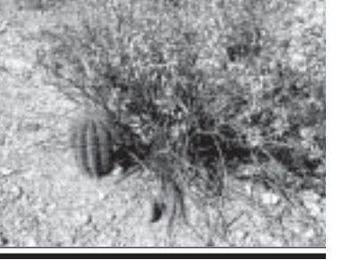
Saguaro seedling being protected from the burning sun