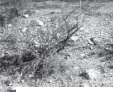
A Prickly Pear Cacti seedling getting a start from a Bursage plant.